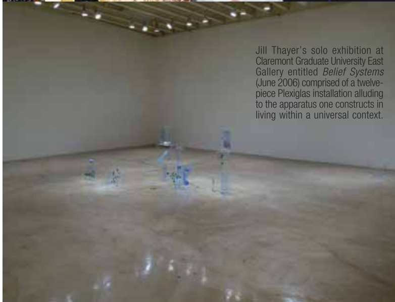
Jill Thayer's solo exhibition at Claremont Graduate University East Gallery entitled Belief Systems (June 2006) comprised of a twelve-piece Plexiglas installation alluding to the apparatus one constructs in living within a universal context.