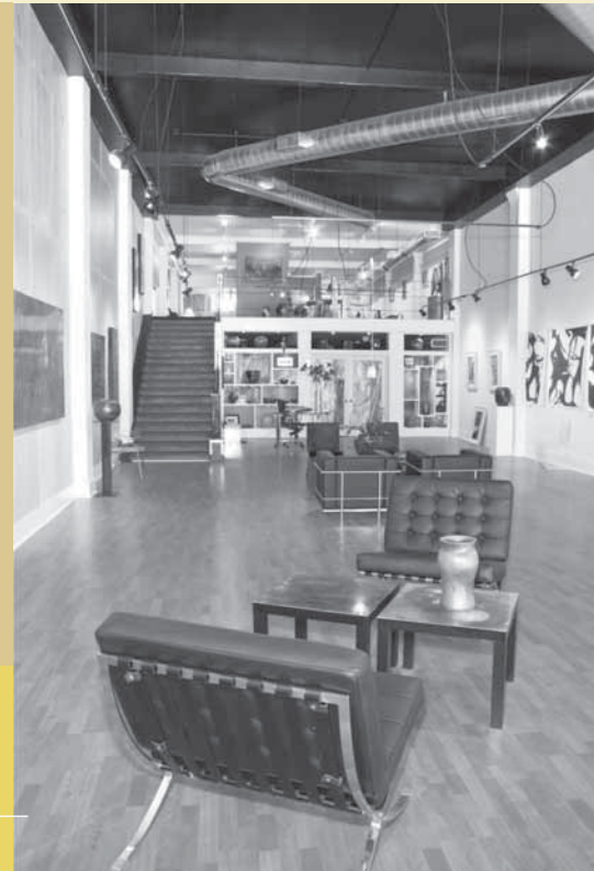
Jill Thayer Galleries at the Fox

The Arts District and burgeoning gallery scene offers a unique aesthetic experience in a diversity of spaces.